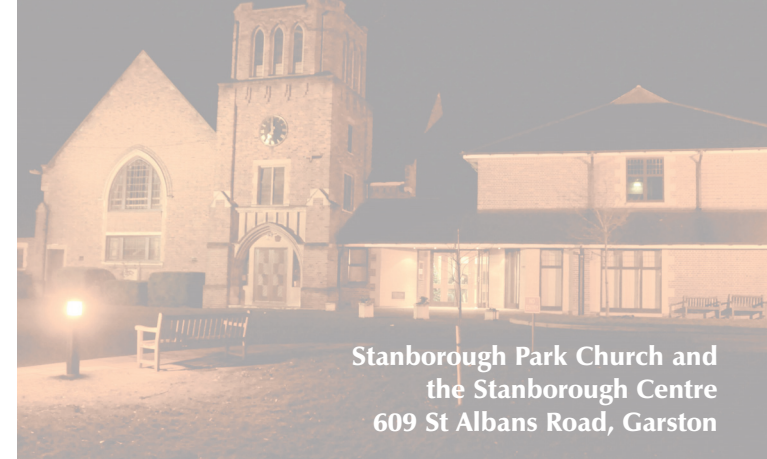
Stanborough Park Church and the Stanborough Centre 609 St Albans Road, Garston

For information about all the events in this leaflet and more, please telephone 01923 894664 or visit the website www.stanboroughchurch.org