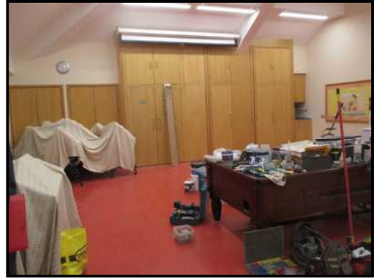
• The Larch Room is

out of action during refurbishment/redecoration until the end of the first week in January.