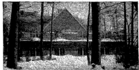
Additional halls at the west of the church still under construction.