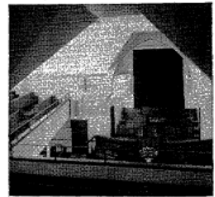
Interior of the Stanborough Park church showing one of the new galleries.

The members of the church are very grateful to a certain minister, not of our denomination, who, owing to the closure of his own church, offered the pews free of charge. This offer was readily accepted, and the pews are now in place, providing further accommodation in this house of God. It is now felt that friends can be invited to the church without fear of embarrassment over seating problems, at least for a good while.