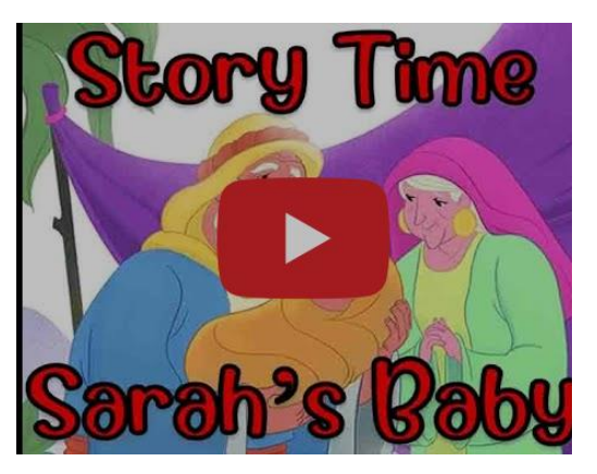
Cradle Roll Sabbath School