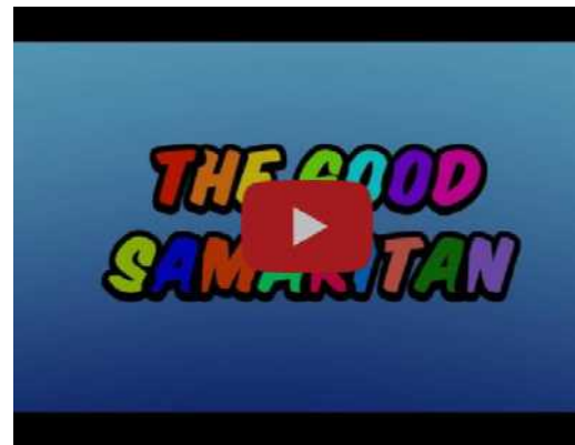
Cradle Roll Sabbath School