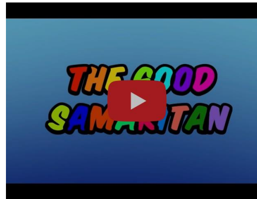
Cradle Roll Sabbath School