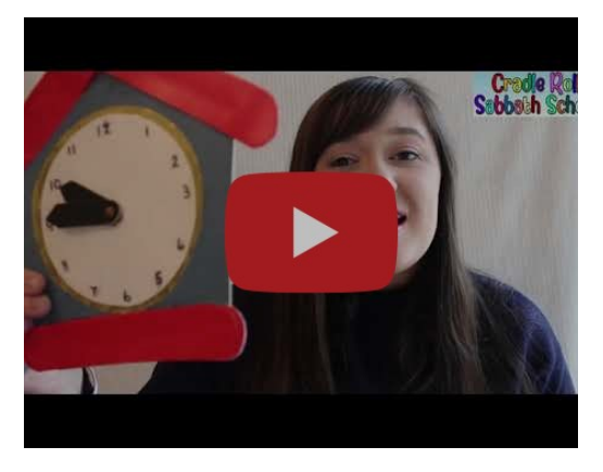
Cradle Roll Sabbath School APRIL