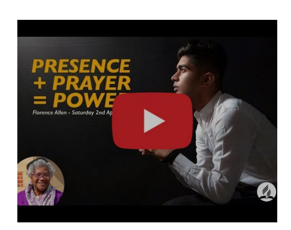
Presence + Prayer = Power