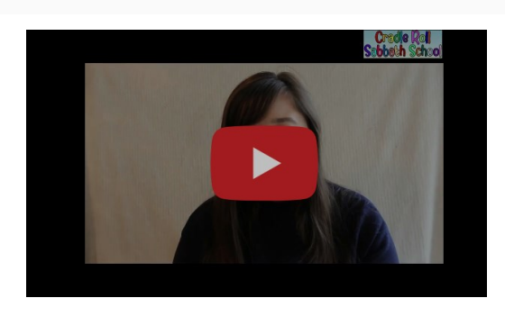
Cradle Roll Sabbath School - MARCH