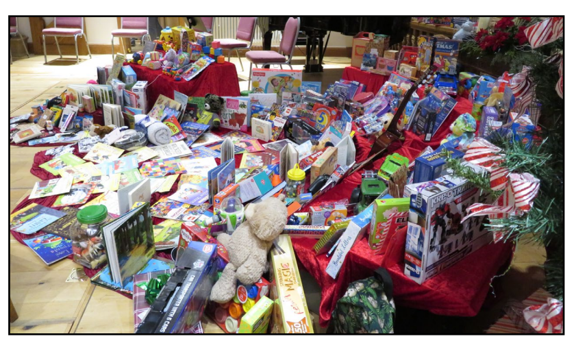
See BUC NEWS: <u>https://adventist.uk/news/article/go/2021-12-</u> 22/1038/?utm_source=BUC+NEWS&utm_campaign=ff350cd9e7-

The large display of presents on the platform was added to as children streamed to the front of the church (whilst following Government guidelines) to add their toys to red 'Santa sacks'. The remarkable generosity of the congregation in the giving of the toys is truly heart-warming and will bring joy to hundreds of Children.