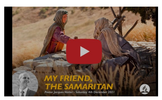
My friend, the Samaritan