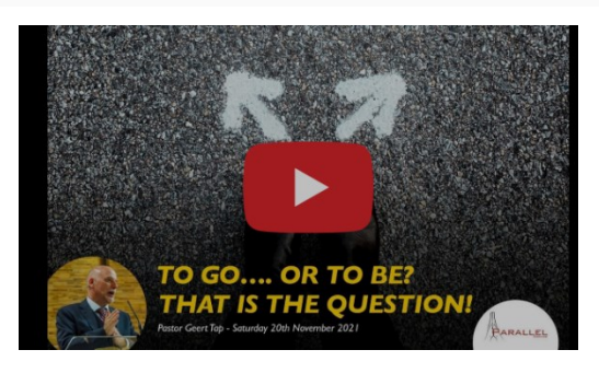
To go... or to be? That is the question!