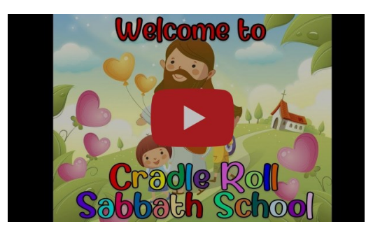
Cradle Roll Sabbath School - NOVEMBER