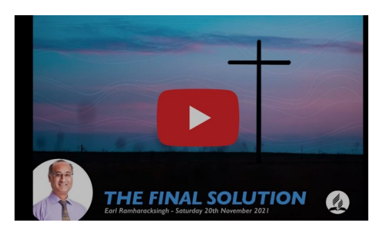
The Final Solution