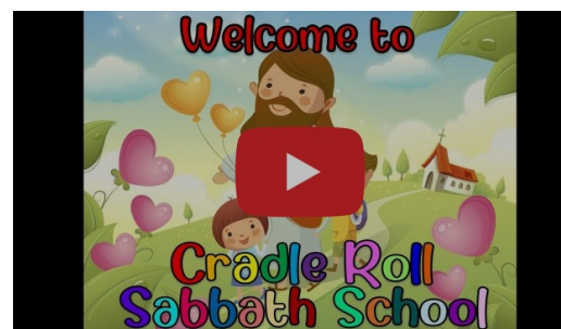
Cradle Roll Sabbath School - NOVEMBER