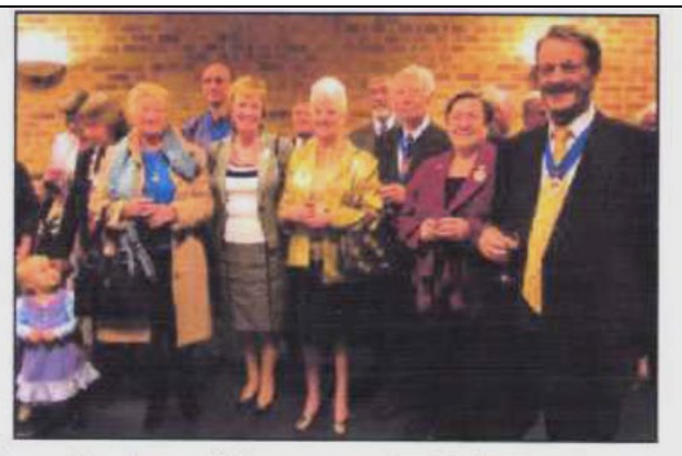
Members of the community flocked to the event to celebrate the service's 50th birthday.

"Perhaps an awareness of the fact that some are suffering severe hardship at the moment local community groups and social workers encouraged the members' generosity ensuring including that some local children could have a better Christmas than their parents had anticipated."