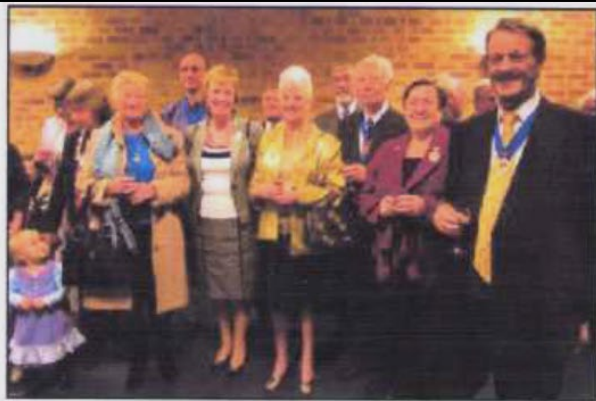
Members of the community flocked to the event to celebrate the service's 50 th birthday.

"Perhaps an awareness of the fact that some are suffering severe hardship at the moment encouraged the members' generosity ensuring that some local children could have a better Christmas than their parents had anticipated."