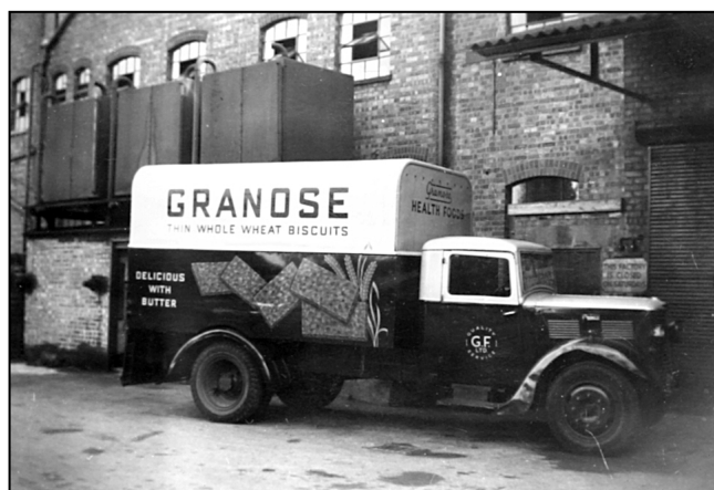
Some more Granose photos including packing Sunnybisk and the Sunnybisk oven.