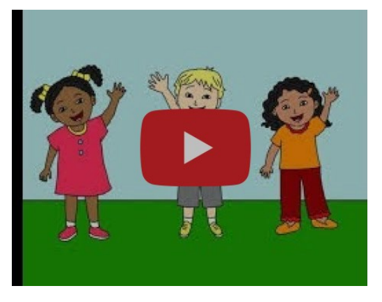
Cradle Roll Sabbath School