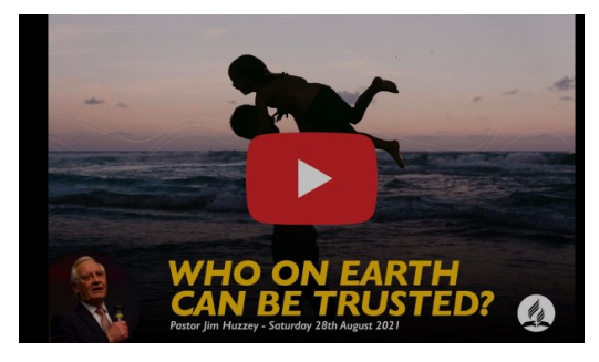
Who on Earth can be trusted?