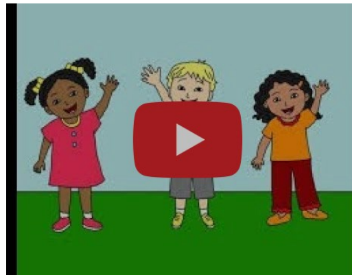
Cradle Roll Sabbath School - August 2021

Invite a friend to subscribe to the eBulletin