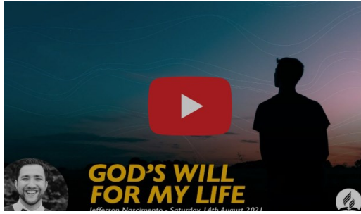
God's will for my life