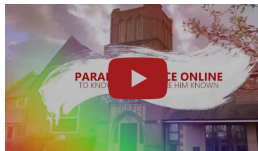
Parallel Service 17th July