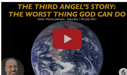
The third Angel's Story