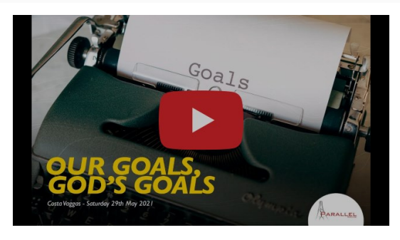
Our Goals, God's goals