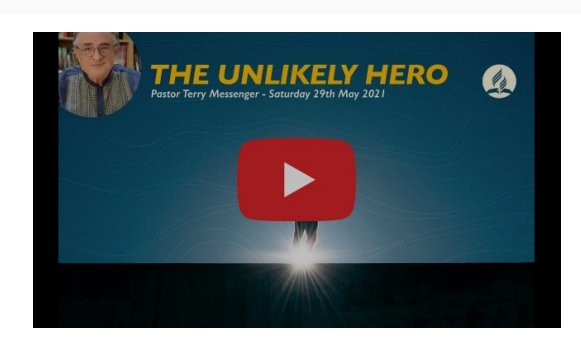
The Unlikely Hero