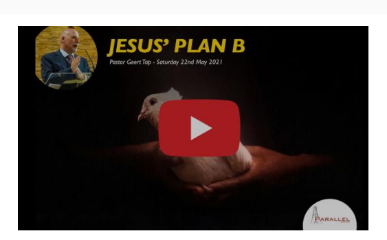
Jesus' plan B