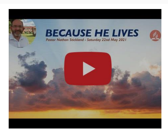
Because He lives