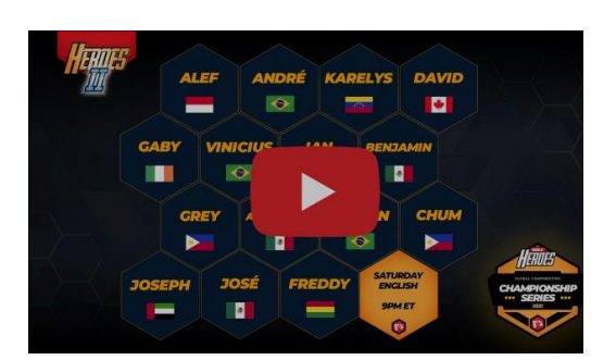
Bible Heroes World Championship