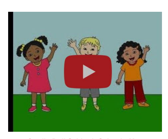
Cradle Roll Sabbath School - May 2021