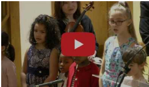
Wonderful, Merciful Saviour