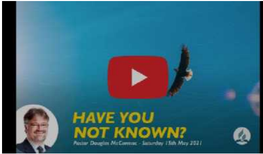
Have you not known?