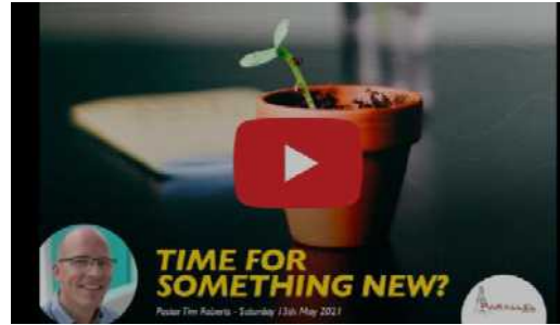
Time for something new?