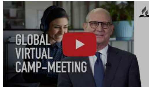
Adventist Global Camp-Meeting

Invite a friend to subscribe to the eBulletin