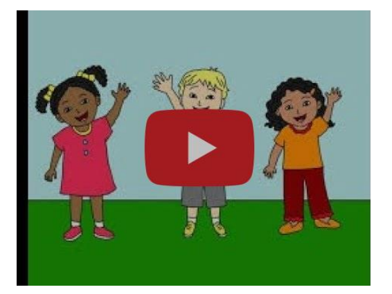
Cradle Roll Sabbath School - 8th May 2021