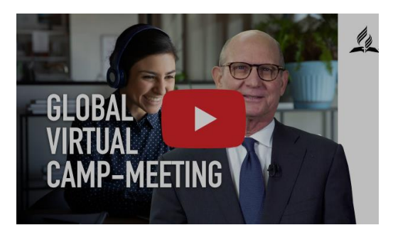
Adventist Global Camp-Meeting