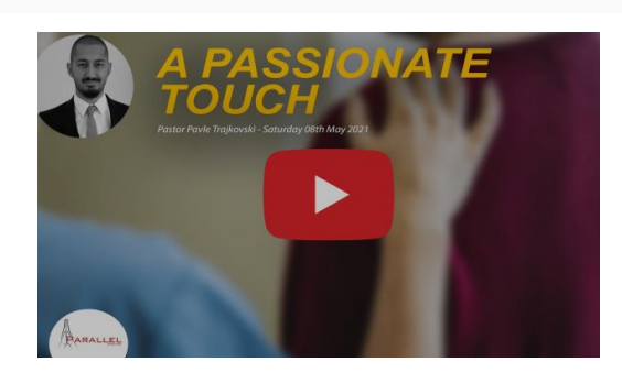
A Passionate Touch