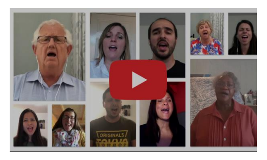
How Deep The Father's Love For