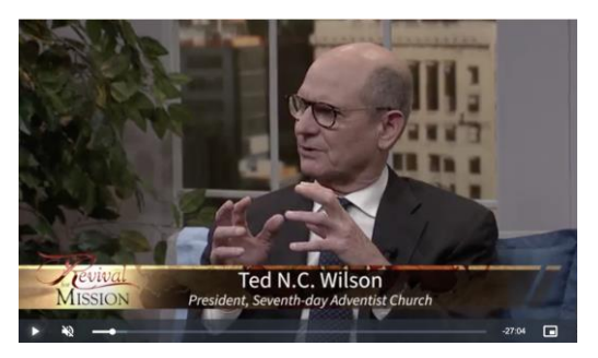
GAMING FOR GOOD