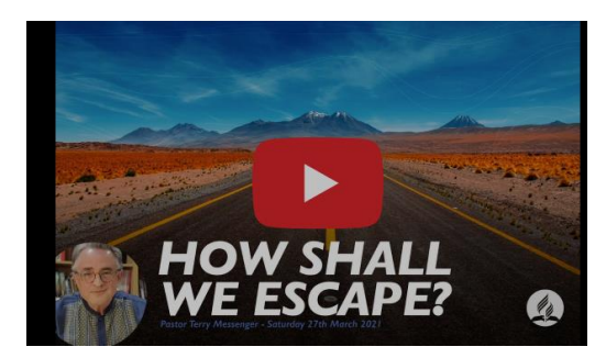
How shall we escape?