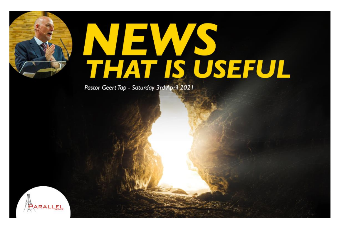
Watch the Parallel Service online with Pastor Geert Tap