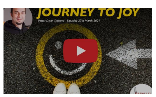
JOURNEY TO JOY