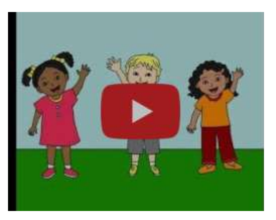
Cradle Roll Sabbath School - March 3rd Edition 2021