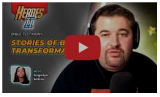
STORIES OF BIBLE TRANSFORMATION