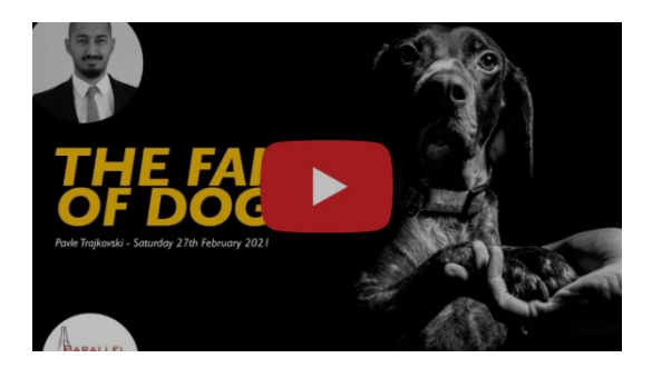
The faith of Dogs