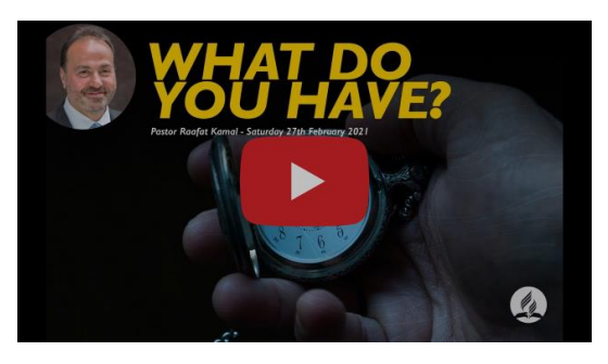
What do you have?