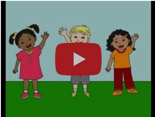
Cradle Roll Sabbath School - February 4th Edition 2021