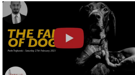
The faith of Dogs