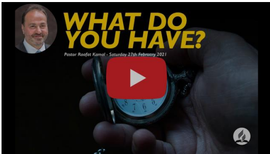
What do you have?