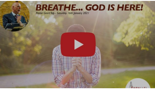
"Breathe... God is here"