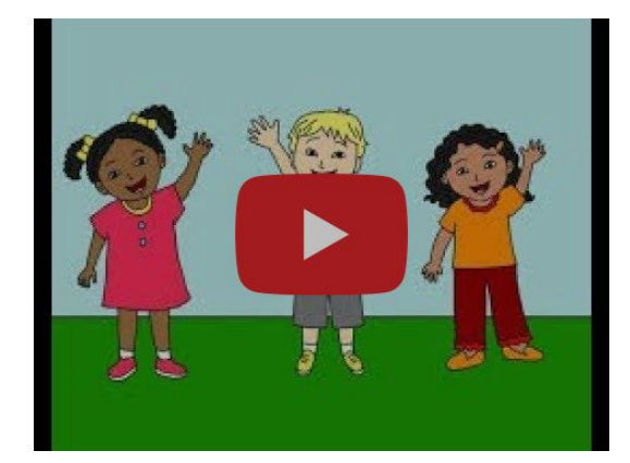
Cradle Roll Sabbath School - 2nd Edition of January 2021