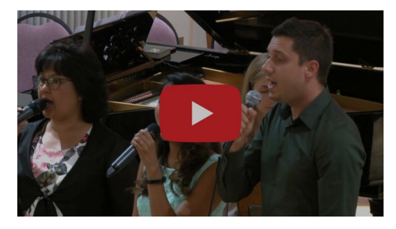
Vocal Ensemble at Stanborough Park Church