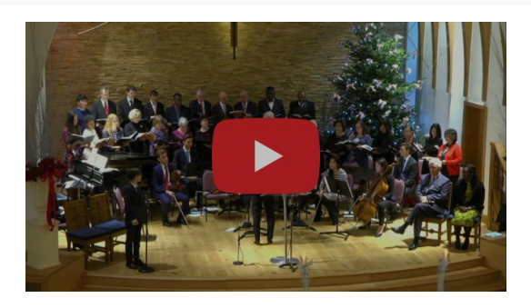
"Glory to God" by Stanborough Park Church Choir, 2017