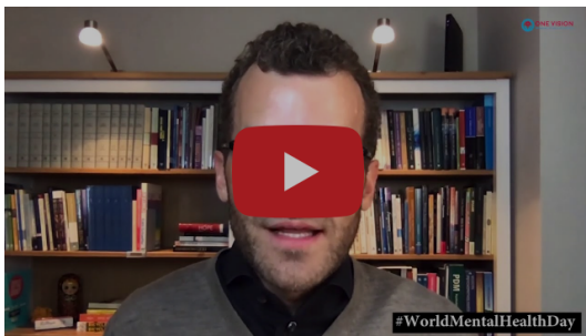
One Vision coming together to support World Mental Health Day