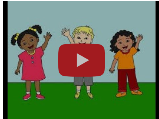
Cradle Roll Sabbath School 2nd video of October

Invite a friend to subscribe to the eBulletin