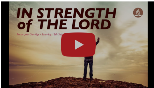
In Strength of the Lord