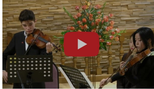
The Holy City Sixteen Strings

Forgiveness | Locking down, Reaching In | Prayer Meeting