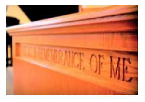
"This is my body, which is for you. Do this in remembrance of me." 1 Corinthians 11:24