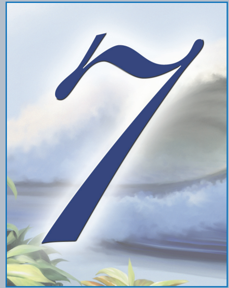
God's symbol of creation is indestructible.

God made the Seventh-day special. It was the indestructible symbol of the fact He created the world. You can no more stop the coming of the seventh day than you can stop the sun from rising in the morning sky. When we work six days and rest on the seventh, we are honoring the God of creation.