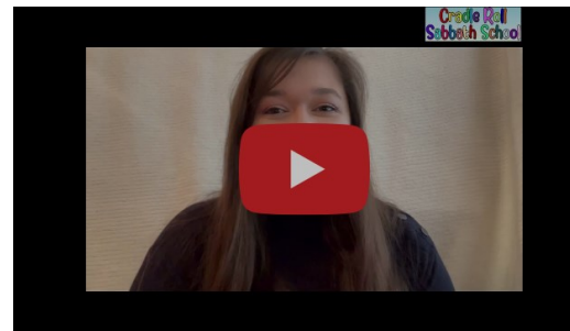
Cradle Roll Sabbath School - January