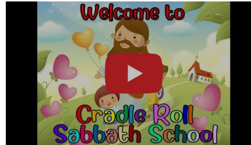
Cradle Roll Sabbath School - OCTOBER