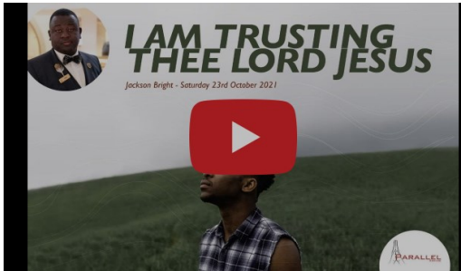
I am Trusting Thee Lord Jesus