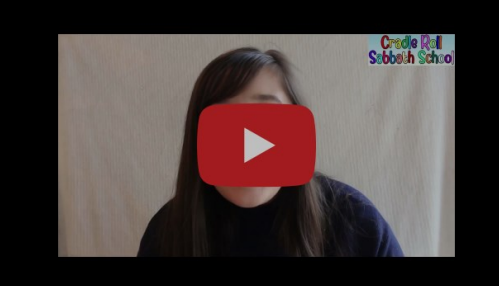
Cradle Roll Sabbath School -September