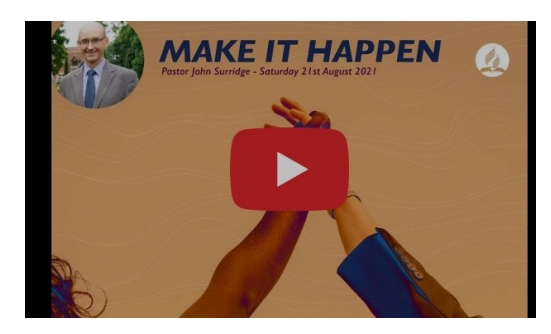
Make it Happen