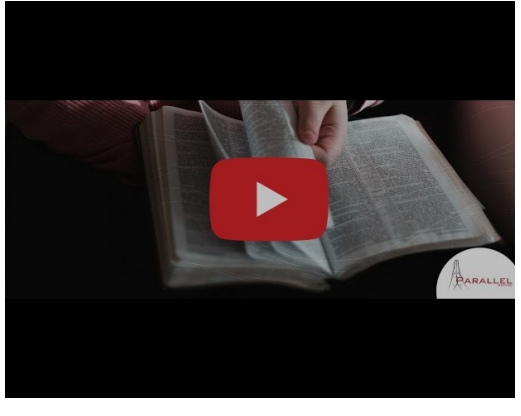
Keep Trusting (Parallel Service)