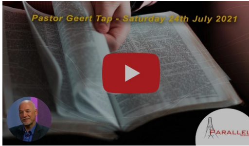
Parallel Service - 24th July