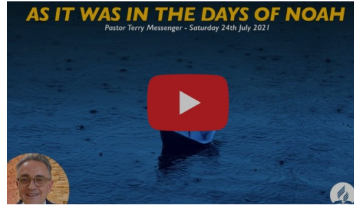
As it was in the days of Noah

Invite a friend to subscribe to the eBulletin