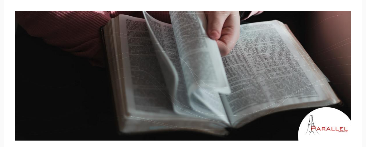
Watch the Parallel Service online

Meeting ID: 840 134 7522, Passcode: 2007691 or click here