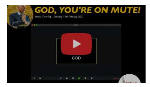
God, you are on mute!