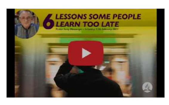
6 Lessons some people learn too late