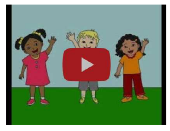
Cradle Roll Sabbath School