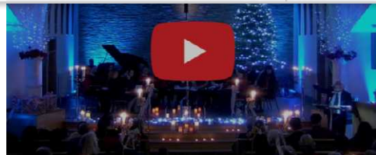
Christmas Eve Candlelight Service 2018