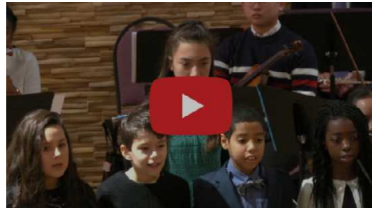
A Christmas Medley, Junior Choir