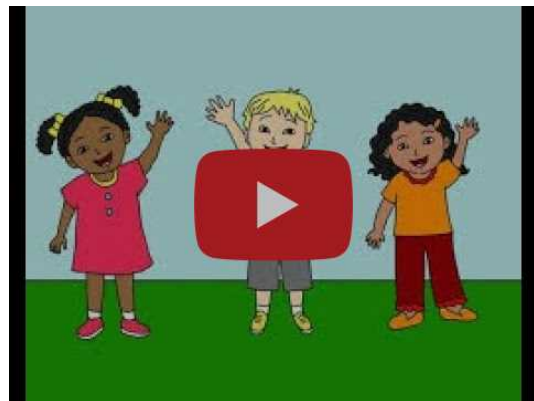
Cradle Roll Sabbath School - 2nd Edition December 2020

Invite a friend to subscribe to the eBulletin