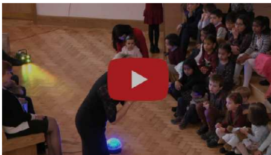
The Three Trees - Children's Story