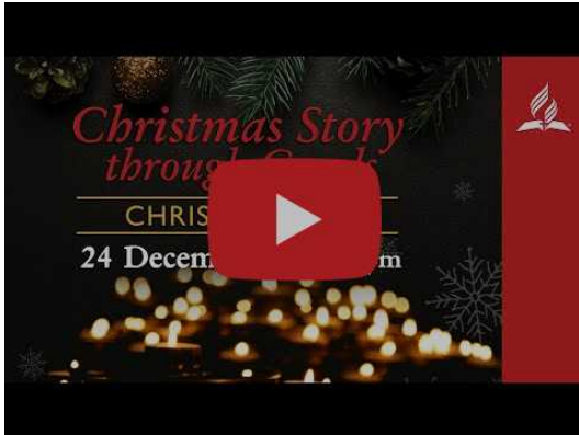
Christmas Story Through Carols 2019