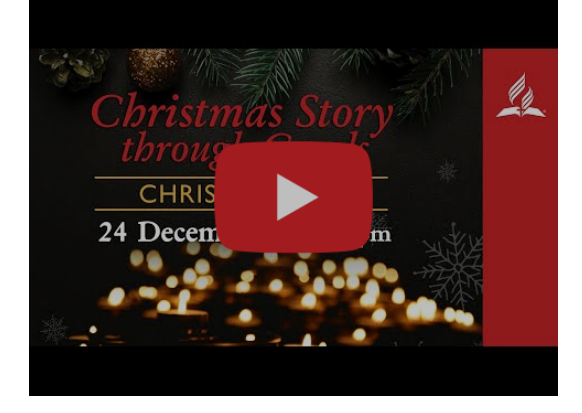
Christmas Story Through Carols