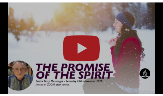
The Promise of the Spirit