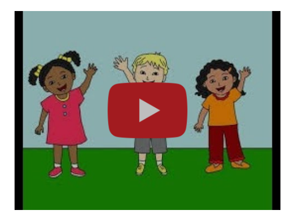
Cradle Roll Sabbath School - 3rd Edition November 2020