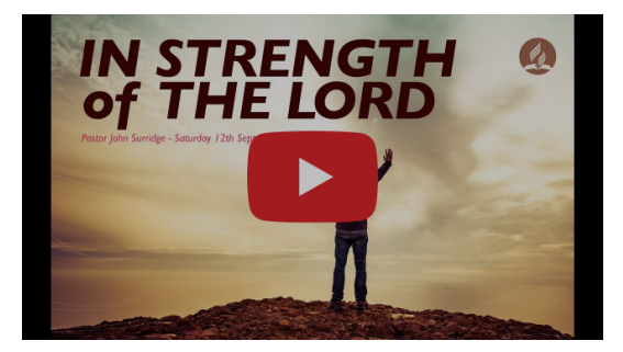
In Strength of the Lord