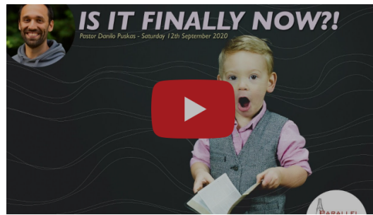
Cradle Roll Sabbath School 2nd video of September