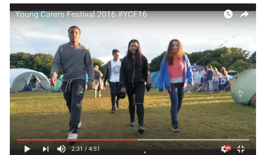
Let the games begin...

The Young Carers Festival this year was attended by 1800 young carers so I thought it was a good place to start looking. Here are a few pics from the video of the festival (you can check it out here youtu.be/u5krNJDmPyM ). The picture above shows some of the kids at the June Young Carers Festival starting to build some friendships by