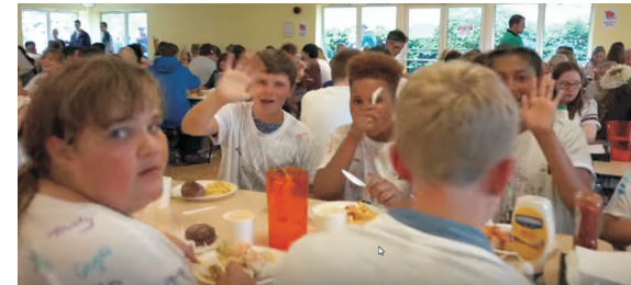
These kids are carers - how much do you care for your family?

There was a pop song with the words "It's my life, I'll do what I want to do". How that turns out depends on your attitude. When you see someone who needs help with their homework, or maybe needs a