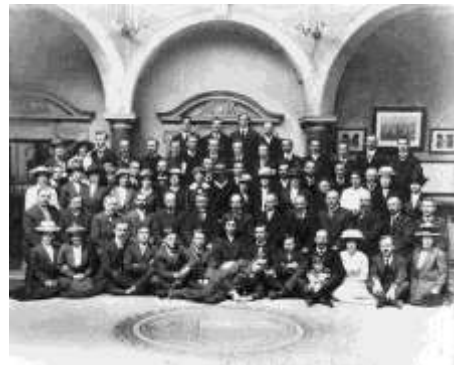
Ministerial workers at the 1914 BUC Meetings at Battersea Town Hall

It might have been difficult to say 'Praise God' in 1914 as 400 Seventh-day Adventist delegates to the British Union Session met in Battersea Town Hall the very weekend that WWI broke out. In their special prayer sessions that weekend it was not so much 'praise God', but that "the forces of strife may be restrained in Europe and that the lives of our brethren and the interests of the cause may be divinely guarded". 1 They were fearful for what the future might hold. And, particularly for their young men, they had good reason to fear.