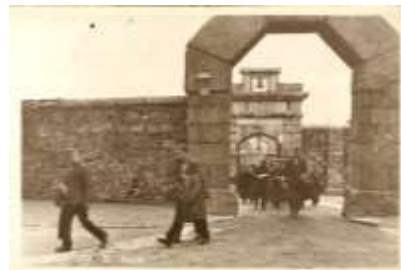
Conscientious objectors heading out from prison for a day's work