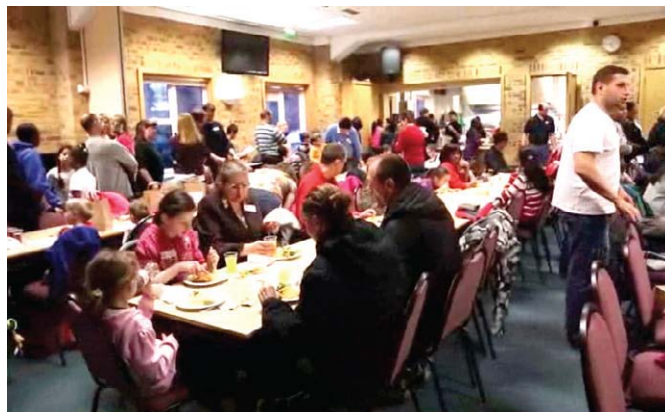
Messy Church shared meal

phenomenon called Messy Church. It is a monthly afternoon programme for local families with children. Messy church involves crafts, play, action songs and bible stories all of which is provided free for the 250 visitors that have been coming. It is such a great way for kids to feel involved with Christianity until they want to learn more and they love it.