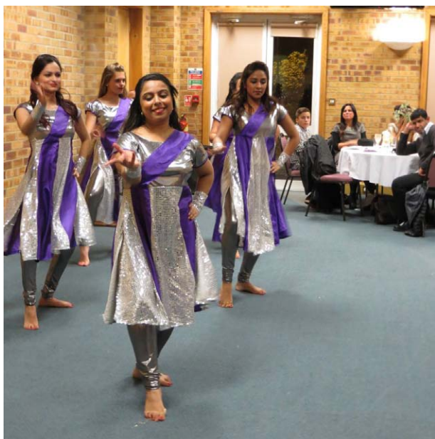
Anita's Dance Factory

The CCS will offer support in many ways other than conventional Chaplaincy work. They are preparing to help those seeking employment with writing CV's and interview techniques, support for adult literacy needs and more practical tasks like gardening, ironing, shopping for the housebound and DIY.