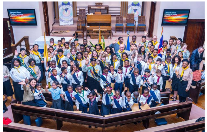
Pathfinder investees at Stanborough Church