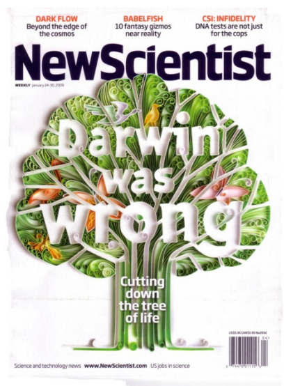
Darwin's tree of life demolished by molecular biology

Give teachers a break, they only 'obeying orders' and children simply follow. Anyone who thinks you are stupid probably understands less about evolution than you do. ■